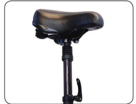
Fig. 4.3. Seat Post Inserted Correctly, Past "Minimum Insert Line"