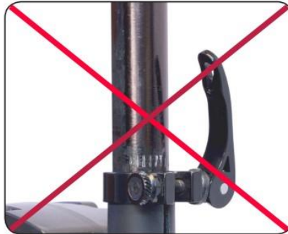
Fig. 4.2. Incorrectly Installed Seat Post