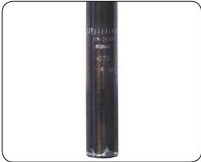
Fig. 4.1. Seat Post, "Minimum Insert Line"